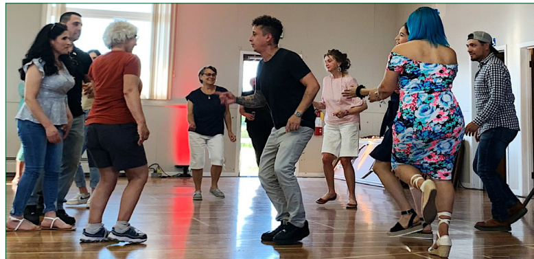
Longtime and newly arrived residents of Clare gathered at our Latin Night event, one of several activities at this year's Journées multiculturelles de Clare.